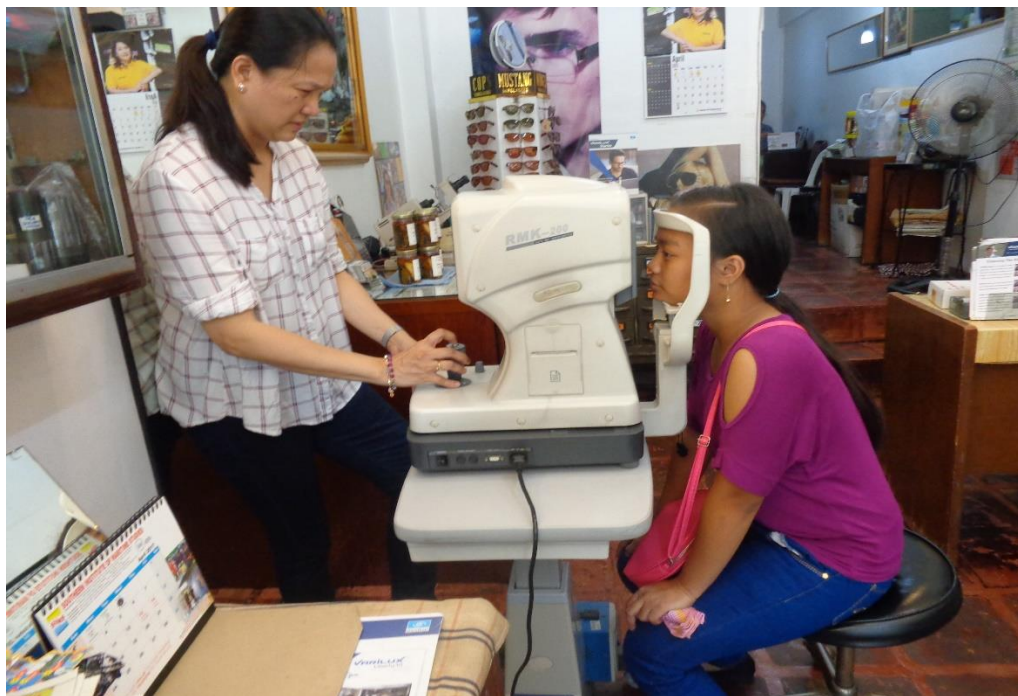
THE PROUD ANNOUNCEMENTS FOR JUN '17 TO DEC '17