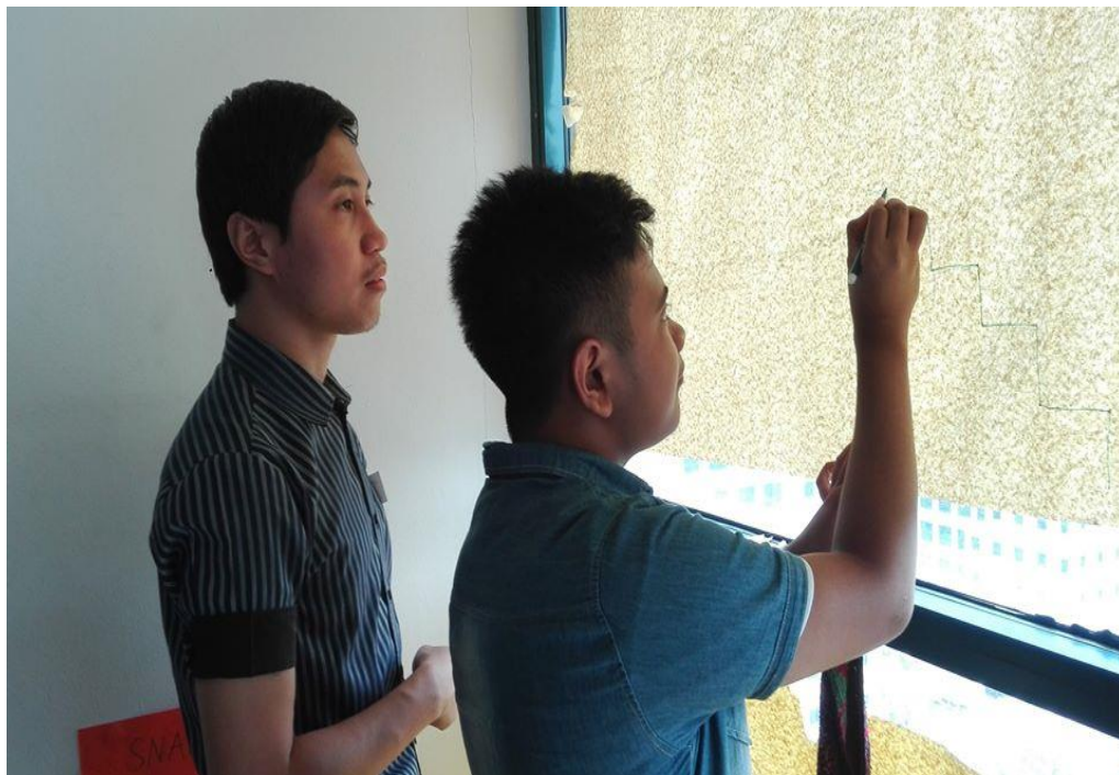
THE PROUD ANNOUNCEMENTS FOR JUN '17 TO DEC '17