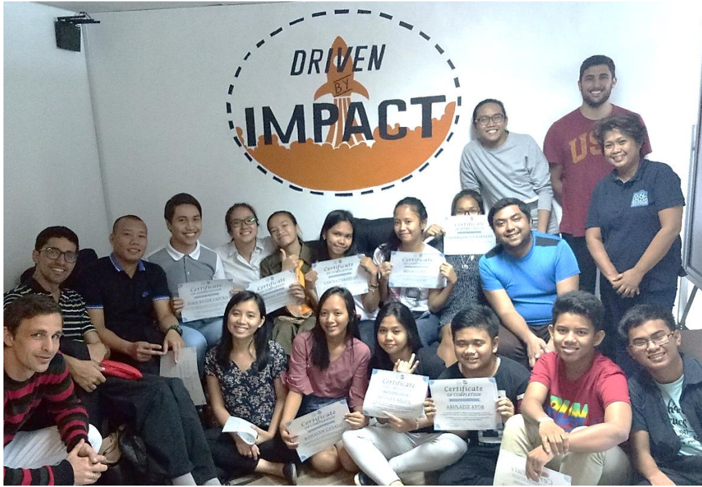
THE PROUD ANNOUNCEMENTS FOR DEC '17 TO APR '18