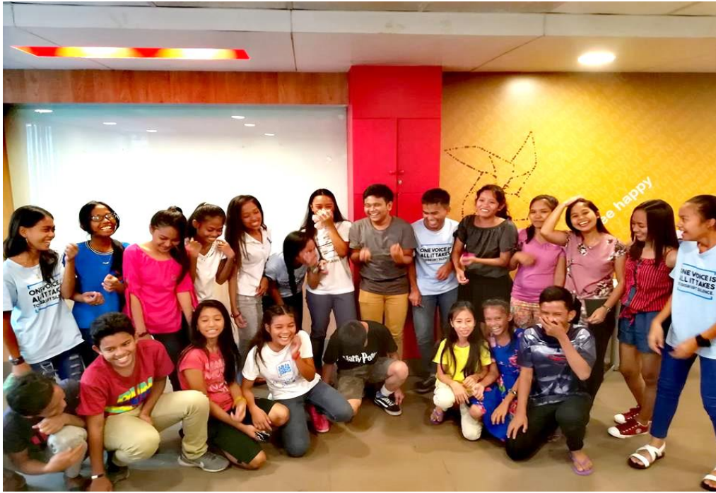
THE PROUD ANNOUNCEMENTS FOR DEC '17 TO APR '18