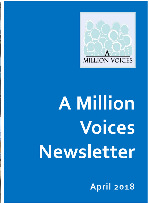
THE PROUD ANNOUNCEMENTS FOR DEC '17 TO APR '18